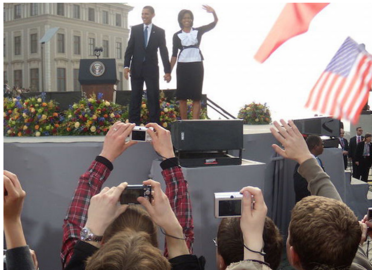
Image: President Obama and his Wife, Michelle in 2009 in Prague