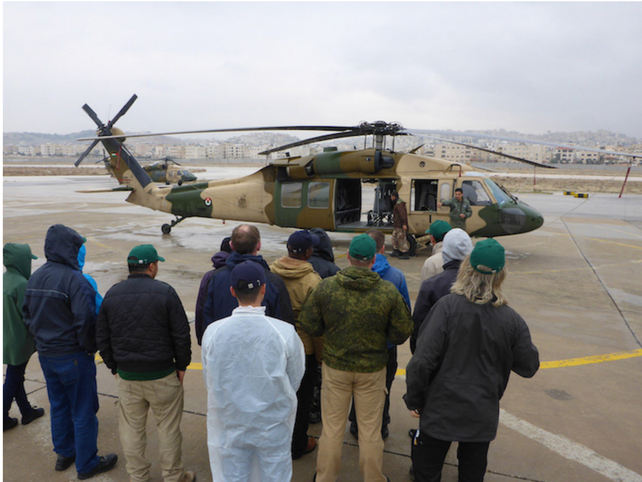
Image: Third On-Site Inspection Training Cycle Health, Safety and Security Training Course | CTBTO

Whether it is to detect earthquakes and provide real time warnings of tsunamis, track severe storm systems or radiation dispersal from nuclear accidents, or advance the study of meteorology, climate change and ocean life, CTBT data potentially offers a unique and invaluable contribution to the development of human well-being, Zerbo said. [IDN-InDepthNews – 23 February 2017]