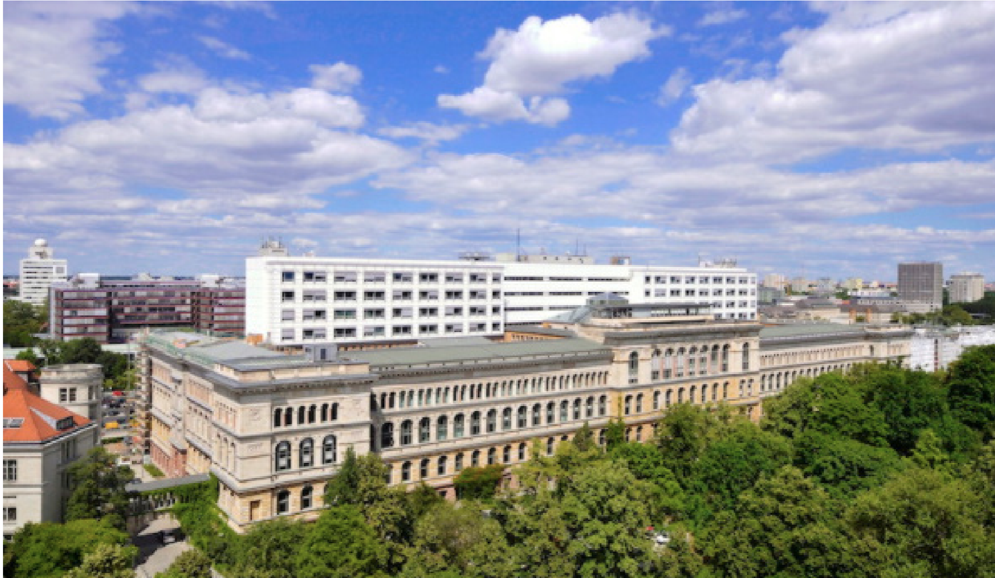
Image: Technical University Main Building