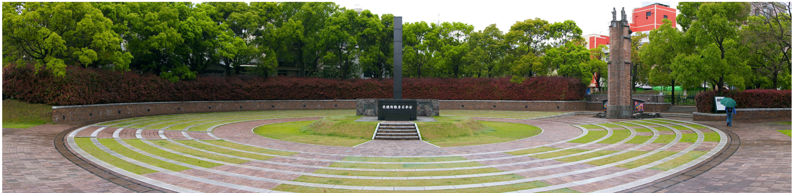
Panoramic view of the monument marking the hypocenter, or ground zero, of the atomic bomb explosion over Nagasaki