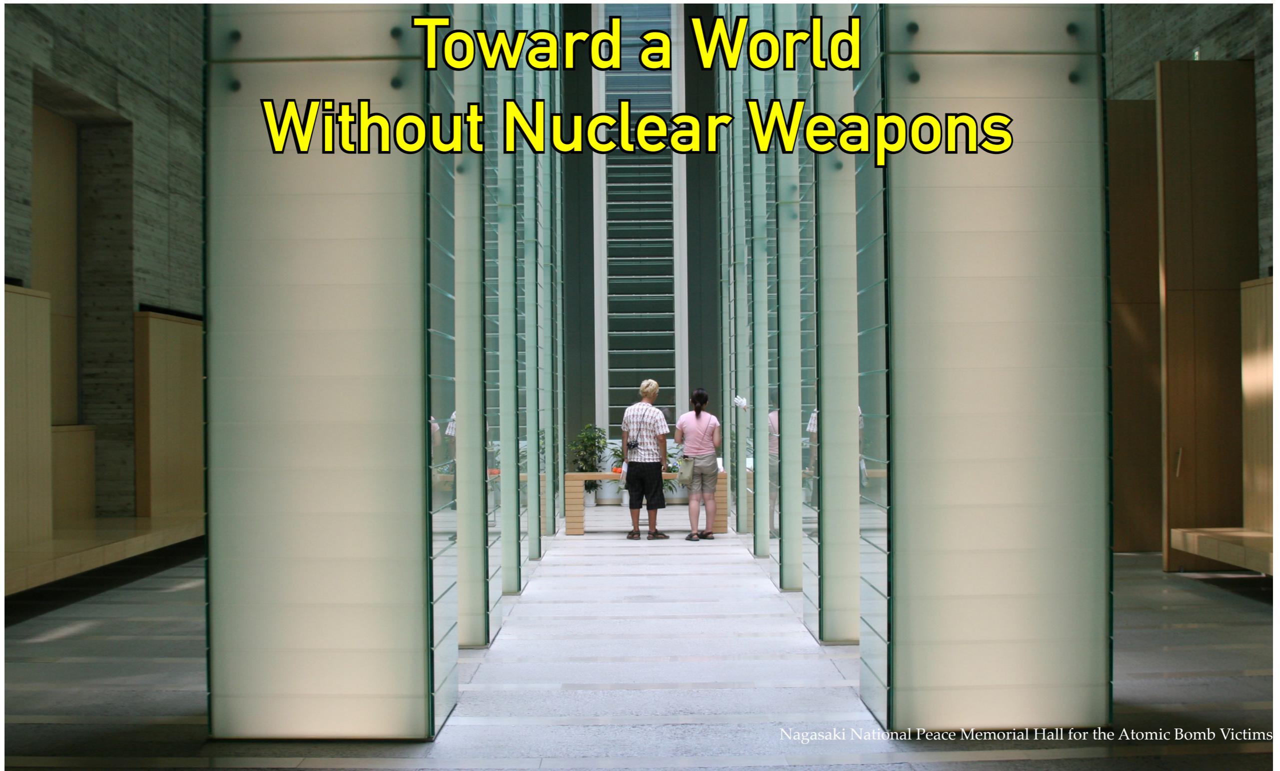
Nagasaki National Peace Memorial Hall for the Atomic Bomb Victims