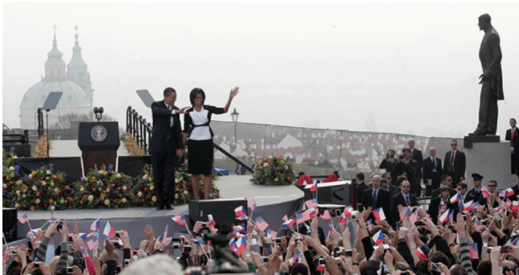
More than 10,000 people crowding a square near Prague Castle cheer the President and First Lady Michelle Obama on April 5, 2009