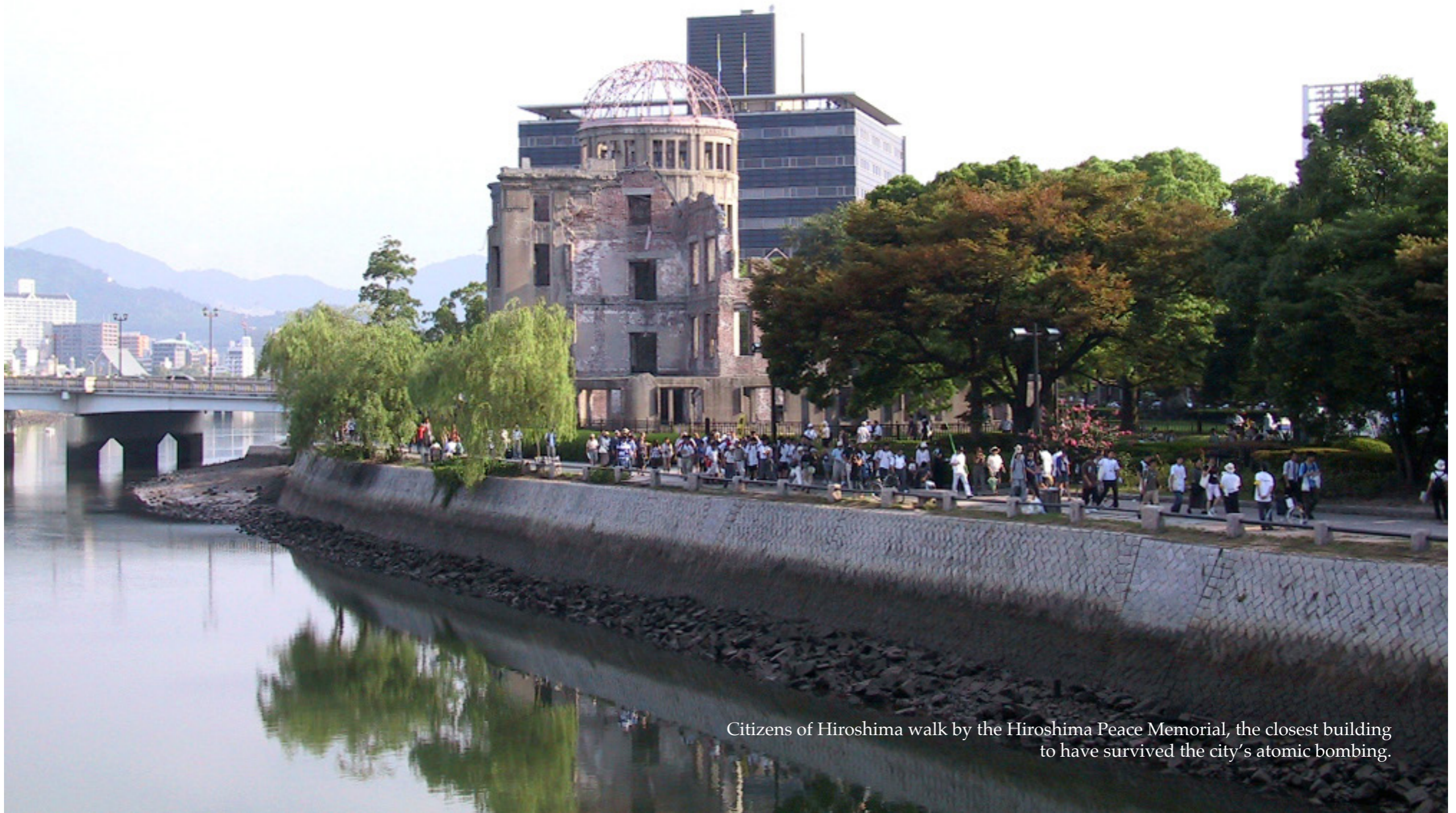
Citizens of Hiroshima walk by the Hiroshima Peace Memorial, the closest building to have survived the city's atomic bombing.