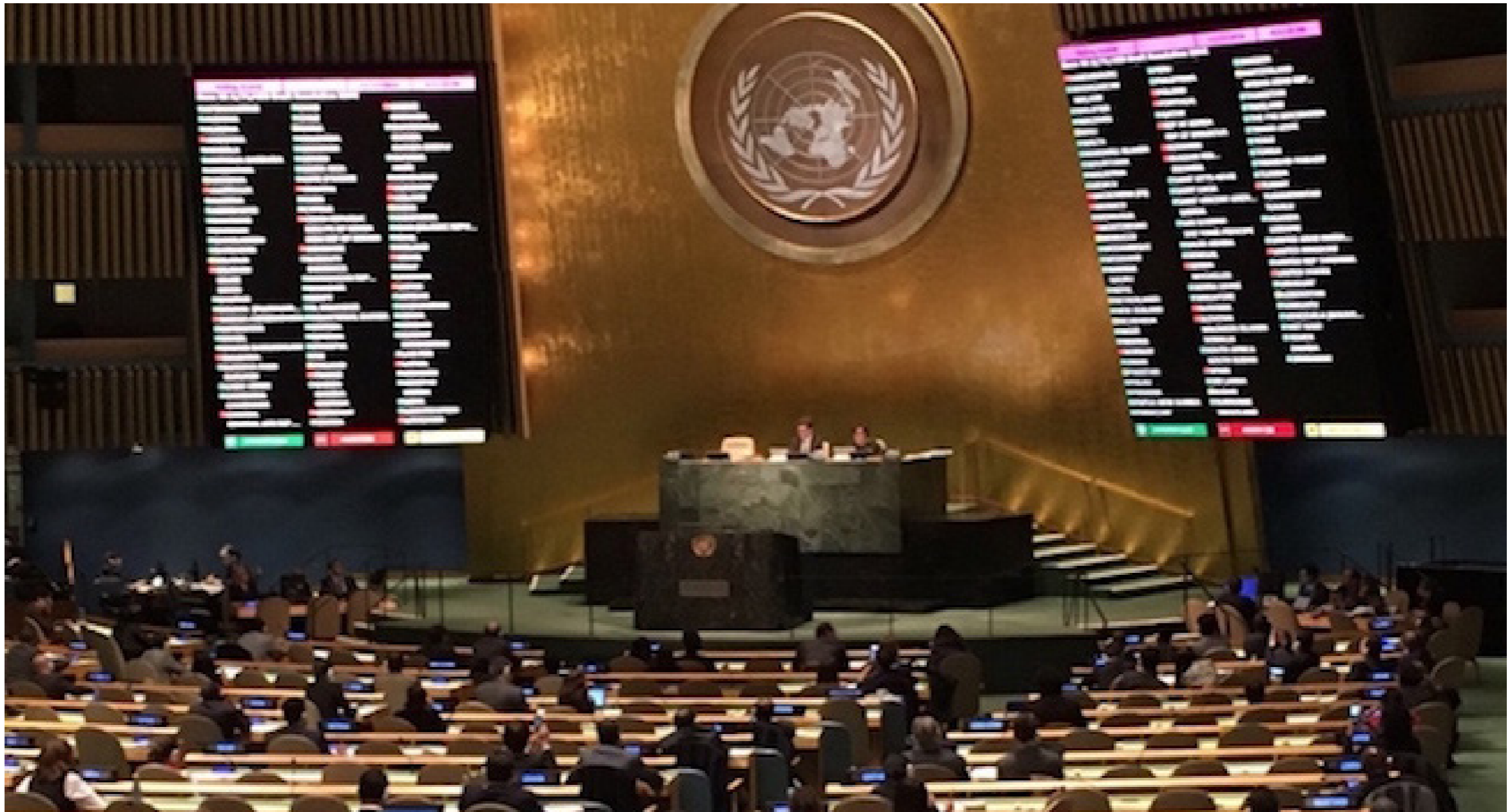
Image: UN General Assembly approves historic resolution on December 23, 2016

“This is a truly historic moment for the entire world,” she said following December 23 vote. “For those of us who survived the atomic bombings of Hiroshima and Nagasaki, we know that nuclear weapons are inhumane, indiscriminate, and unacceptable. All nations should participate in the negotiations next year to outlaw them.” [IDN-InDepthNews – 26 December 2016]