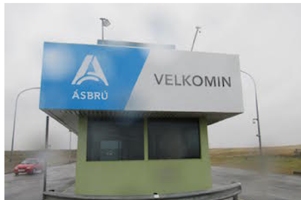
Right: Ásbrú is a part of the former U.S. Naval Air Base Keflavik not supervised by the Icelandic defence authorities.