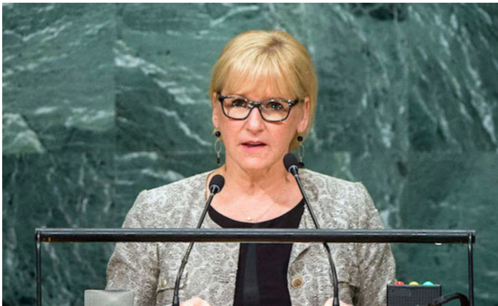
Image: Foreign Minister Margot Wallström of Sweden addressing the UN General Assembly’s seventy-first session in September 2016

But Helgason does not agree, saying “Tillerson is probably the weakest Secretary of State in modern American history. I would not pay much attention to either him or Mattis. Study Steve Bannon [Trump’s chief political strategist] instead – he’s the brains behind Trump.” [IDN-InDepthNews – 23 March 2017]