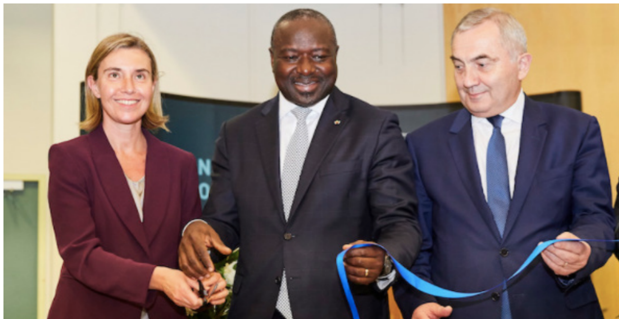
Image: Opening of the CTBT exhibition in the Vienna International Centre’s Rotunda on the occasion of the CTBTO20 Ministerial Meeting June 2016. From left: Federica Mogherini, EU High Representative for Foreign Affairs and Security Policy, CTBTO Executive Secretary Lassina Zerbo and Lazar Comanescu, Foreign Minister of Romania

Dr. Zerbo: I very much welcome the strong support shown to the CTBT and the CTBTO by President Obama and his administration, and I am grateful for his efforts. Senior U.S. officials, including Undersecretary Rose Gottemoeller on June 13 in Vienna, have stated that the United States is considering “ways to affirm the international norm against nuclear testing”. I also believe that any step reaffirming not just the United States’ commitment to a nuclear test ban, but that of the international community is a step in the right direction, and a resolution by the Security Council would clearly send a strong signal. Nevertheless, we should not allow this to divert our attention from the real unfinished business: the fact that we have a Treaty which is operational, yet still not in force, after 20 years. A Security Council resolution might be a good thing, but what really counts is the ratification of the remaining eight countries. [IDN-InDepthNews – 18 July 2016]