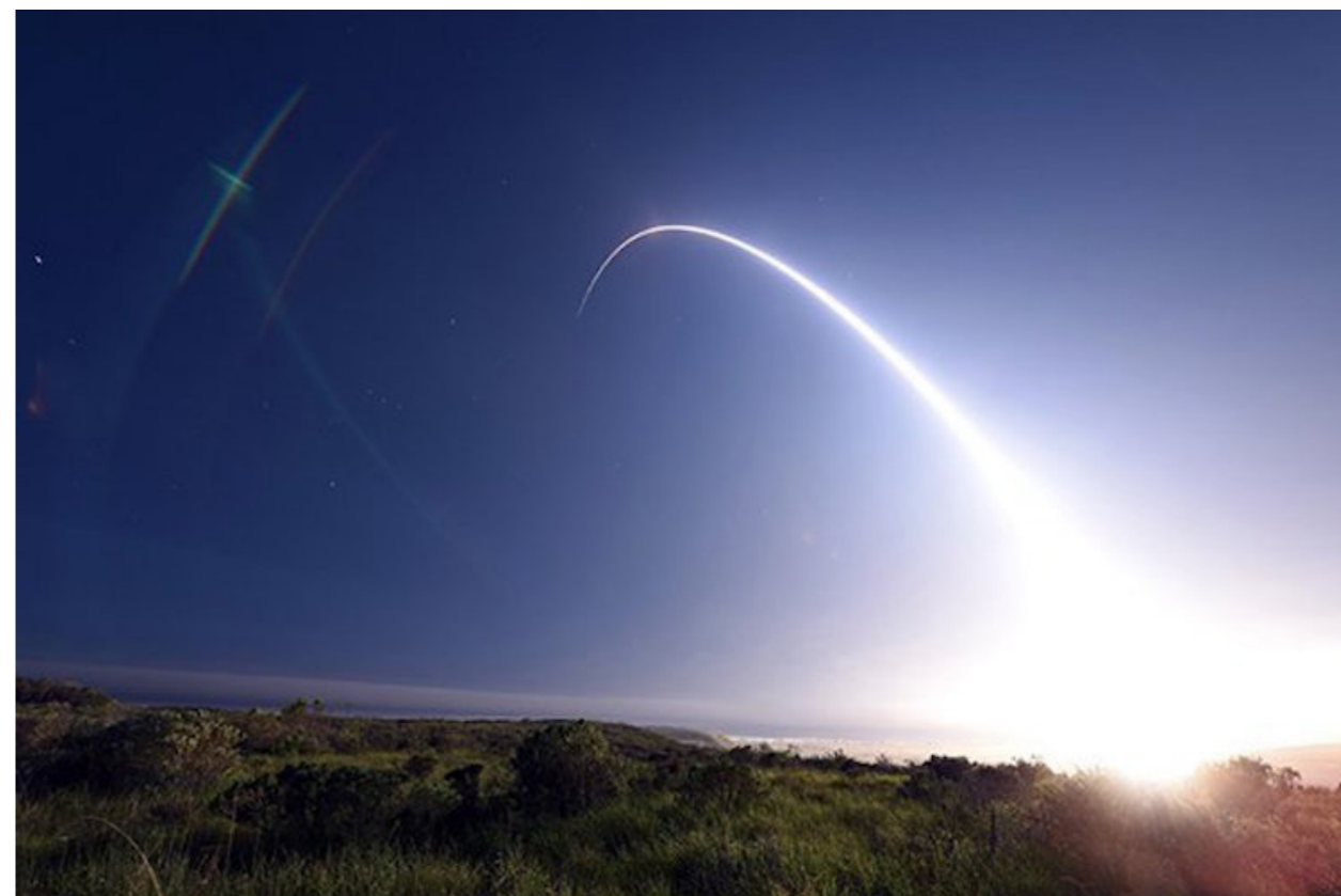
Image: An unarmed Minuteman III intercontinental ballistic missile is launched during a 2016 operational test at Vandenberg Air Force Base, California