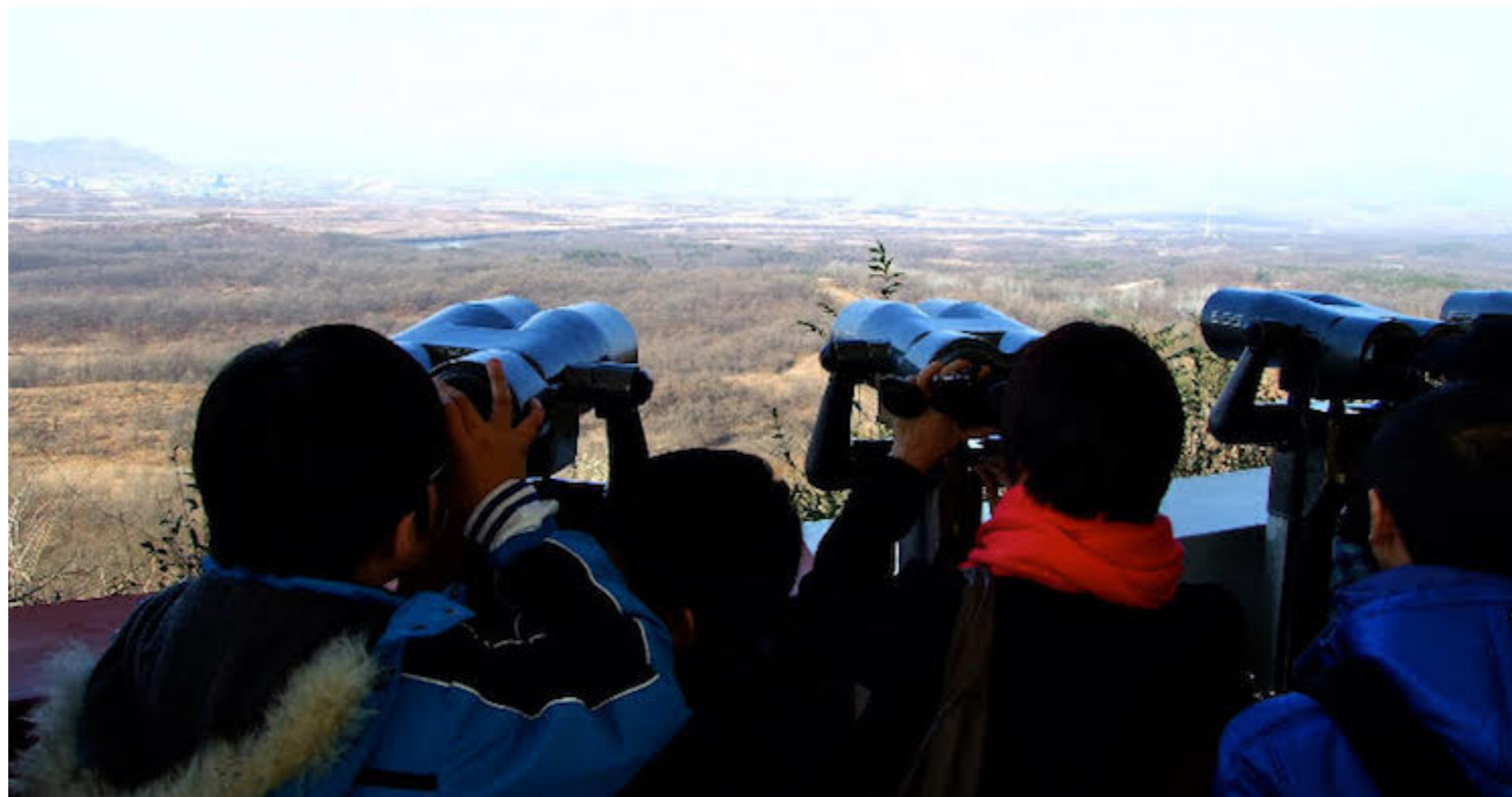
Photo: Gauging North Korea from South Korean side of the Demilitarized Zone | Kalinga Seneviratne | IDN-INPS

He warns that “a vicious cycle is in the making (and) the peninsula policies adopted by the U.S. and the ROK are not conducive to lasting peace, as they have exhausted the very few opportunities to replace the 1953 armistice with a peace treaty’. [IDN-InDepthNews – 10 September 2016]