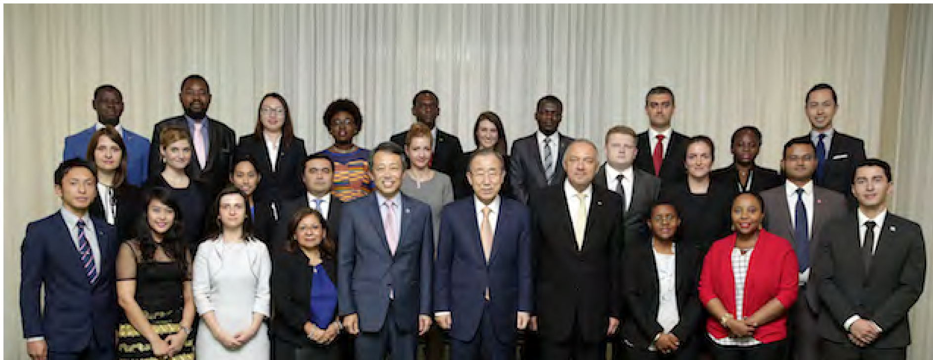
Photo: Secretary-General Ban Ki-moon (front row, centre right) poses for a group photo with this year’s participants of the United Nations Disarmament Fellowship Programme. On his right is Kim Won-soo, Acting UN High Representative for Disarmament Affairs.