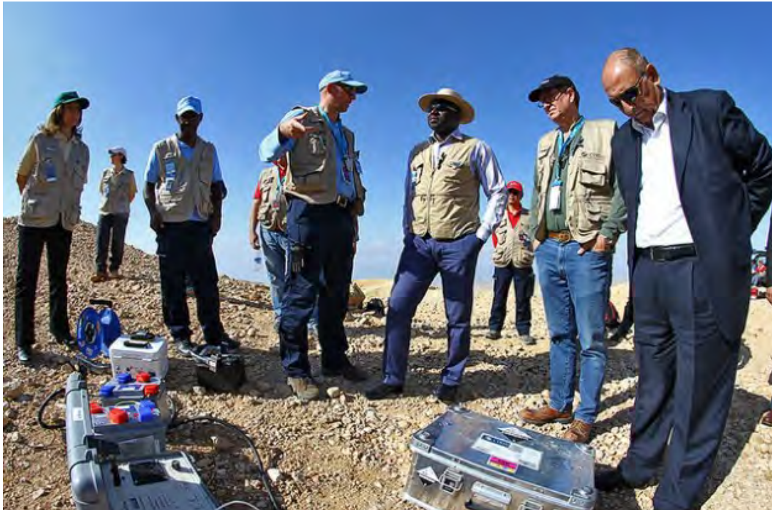
Photo: CTBTO Head Lassina Zerbo overseeing the equipment in use during the Integrated Field Exercise IFE14 in Jordan from Nov. 3 to Dec. 9, 2014. Photo Courtesy of CTBTO

Additional input by Valentina Gasbarri in Vienna.