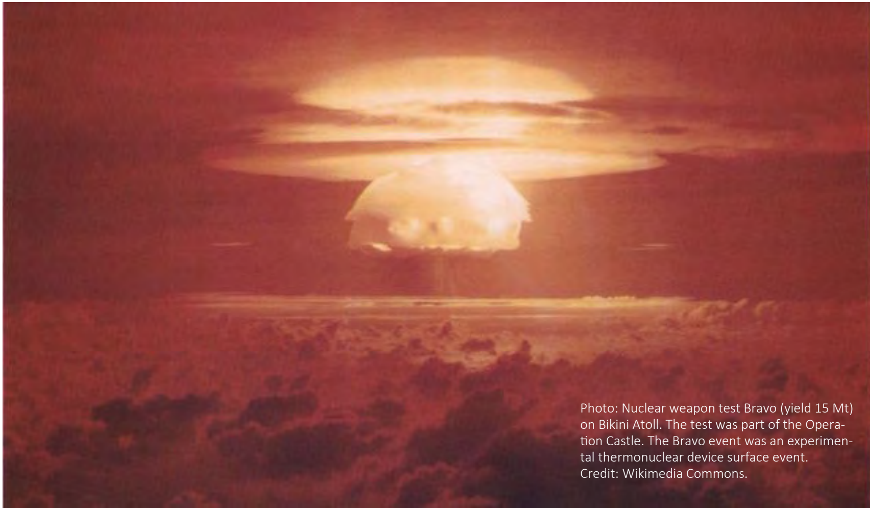
Photo: Nuclear weapon test Bravo (yield 15 Mt) on Bikini Atoll. The test was part of the Operation Castle. The Bravo event was an experimental thermonuclear device surface event.

In his 2009 five-point proposal, UN Secretary-General Ban Ki-moon also urged “all NPT parties, in particular the nuclear-weapon-states, to fulfil their obligation under the treaty to undertake negotiations on effective measures leading to nuclear disarmament”.