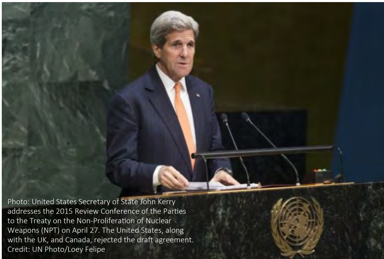
Photo: United States Secretary of State John Kerry addresses the 2015 Review Conference of the Parties to the Treaty on the Non-Proliferation of Nuclear Weapons (NPT) on April 27. The United States, along with the UK, and Canada, rejected the draft agreement.