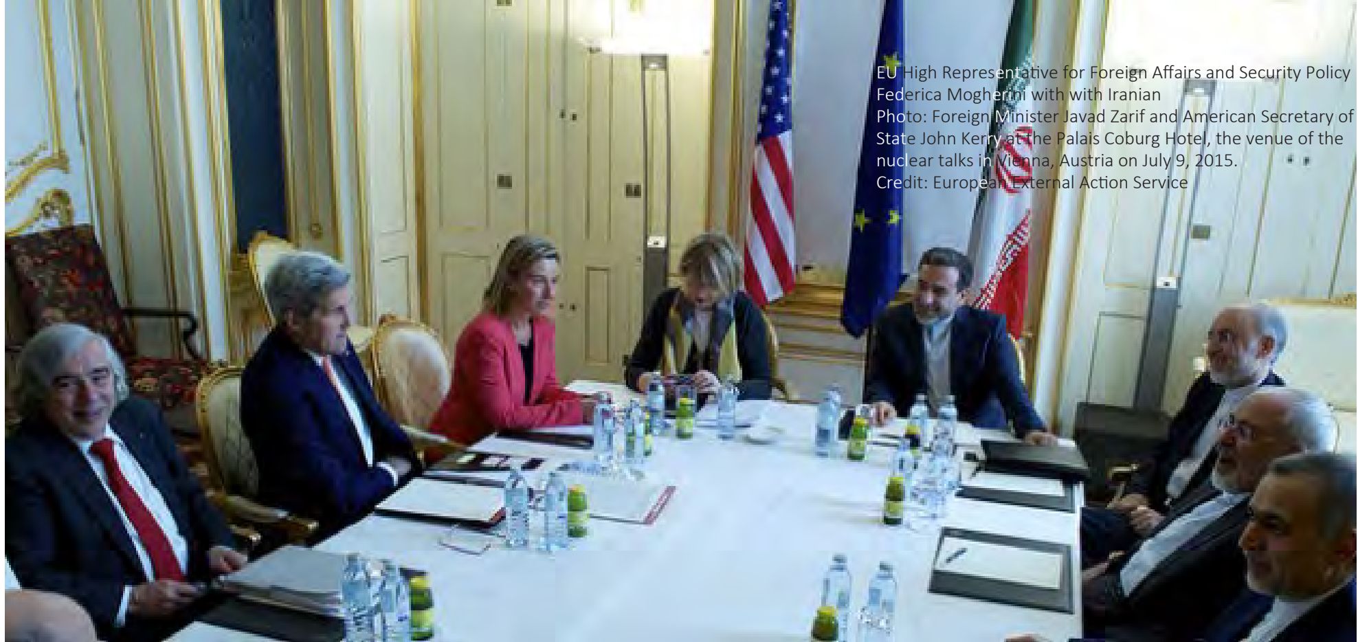
EU High Representative for Foreign Affairs and Security Policy Federica Mogherini with Iranian Foreign Minister Javad Zarif and American Secretary of State John Kerry at the Palais Coburg Hotel, the venue of the nuclear talks in Vienna, Austria on July 9, 2015.

hard-line minority in Iran – rump factions close to former Iranian president Mahmoud Ahmadinejad – that would also benefit if this deal is rejected.