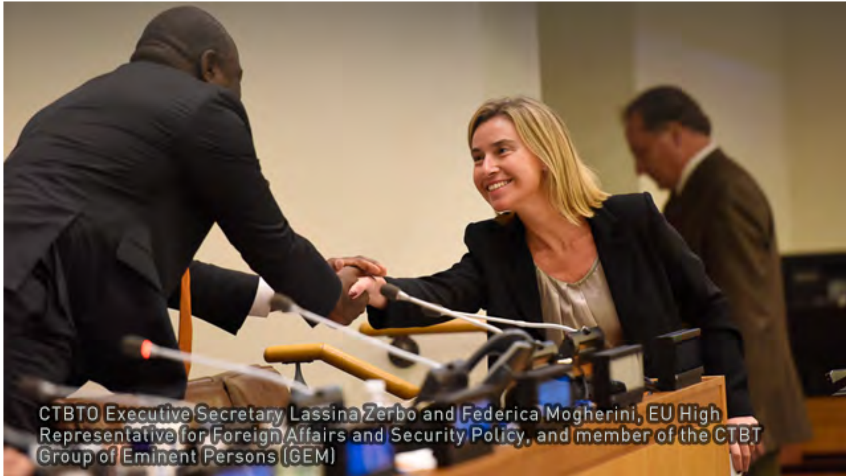
CTBTO Executive Secretary Lassina Zerbo and Federica Mogherini, EU High Representative for Foreign Affairs and Security Policy, and member of the CTBT Group of Eminent Persons (GEM)